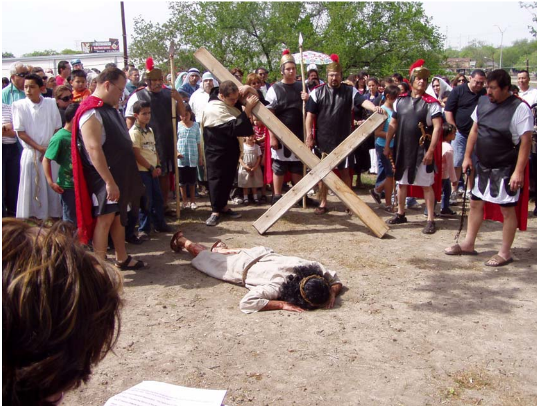
St. Mary Magdalen Parish performed our annual Passion Play on Good Friday in commemoration of the Passion of Jesus.